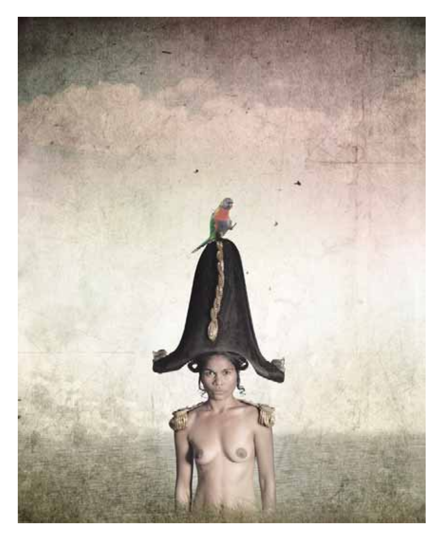
BROKEN DREAMS #4 (2010) Inkjet print (Epson UltraChrome K3™ inks on Hahnemühle Photo Rag® Bright White 310 gsm paper) 124 x 100 cm Edition 8