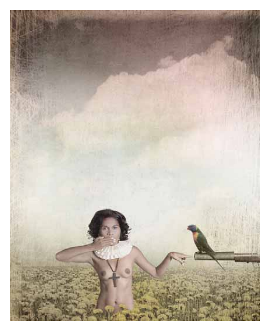
BROKEN DREAMS #6 (2010) Inkjet print (Epson UltraChrome K3™ inks on Hahnemühle Photo Rag® Bright White 310 gsm paper) 124 x 100 cm Edition 8