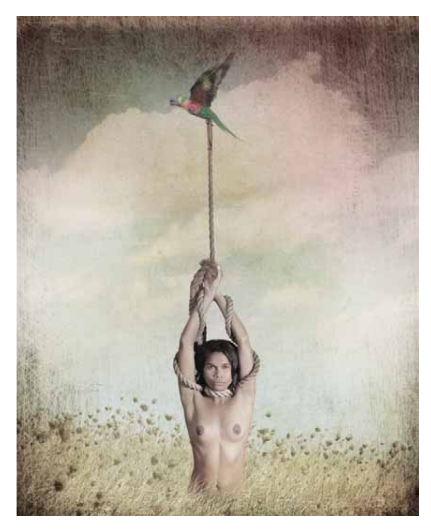
BROKEN DREAMS #10 (2010) Inkjet print (Epson UltraChrome K3™ inks on Hahnemühle Photo Rag® Bright White 310 gsm paper) 124 x 100 cm Edition 8