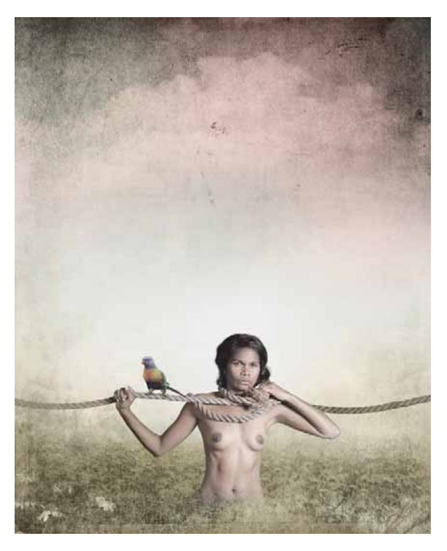
BROKEN DREAMS #8 (2010) Inkjet print (Epson UltraChrome K3™ inks on Hahnemühle Photo Rag® Bright White 310 gsm paper) 124 x 100 cm Edition 8