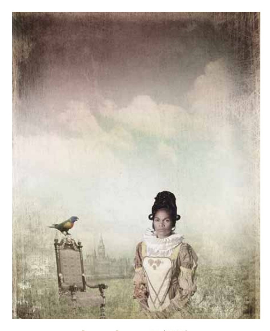
BROKEN DREAMS #1 (2010) Inkjet print (Epson UltraChrome K3™ inks on Hahnemühle Photo Rag® Bright White 310 gsm paper) 124 x 100 cm Edition 8 $44,000 (suite of ten unframed prints)