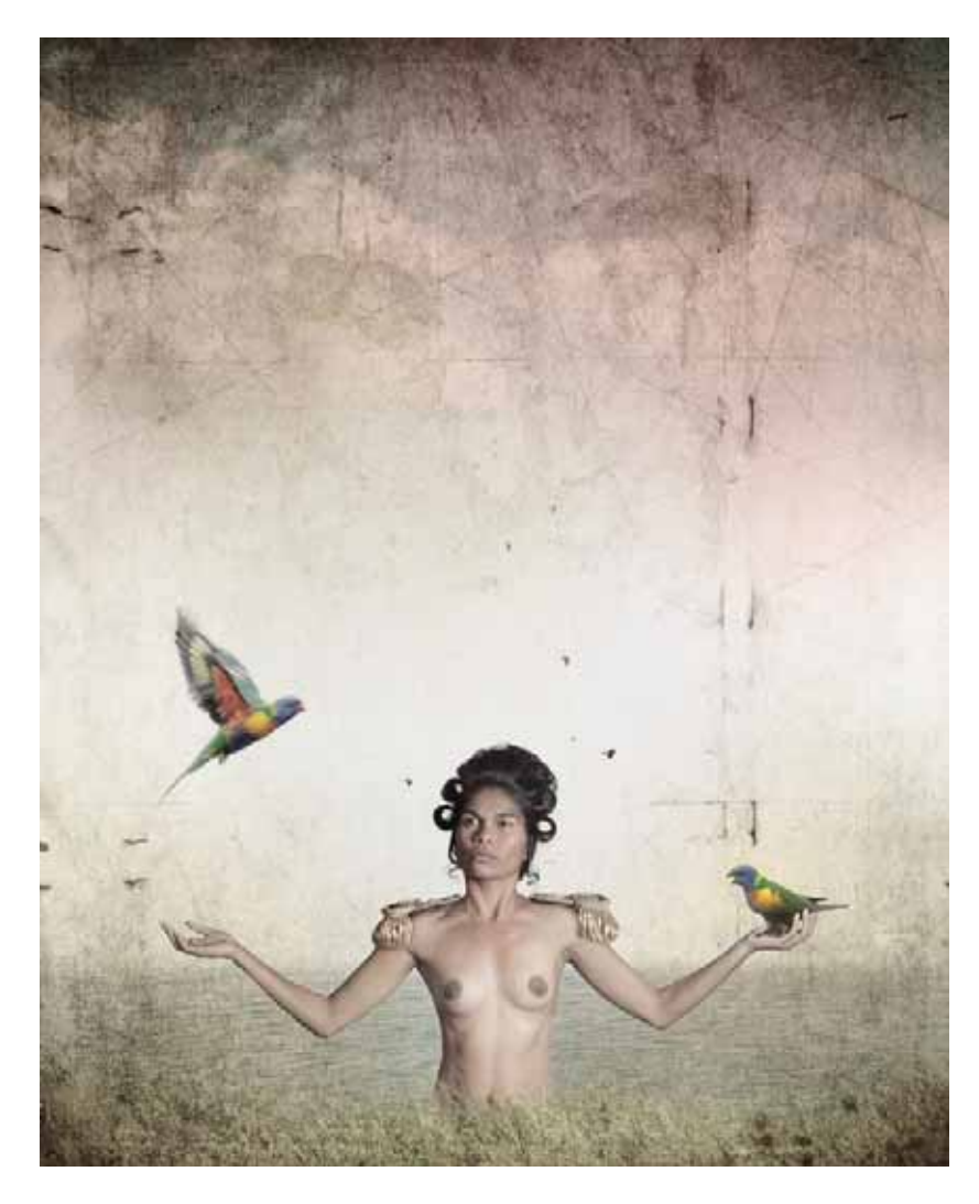
BROKEN DREAMS #5 (2010) Inkjet print (Epson UltraChrome K3™ inks on Hahnemühle Photo Rag® Bright White 310 gsm paper) 124 x 100 cm Edition 8