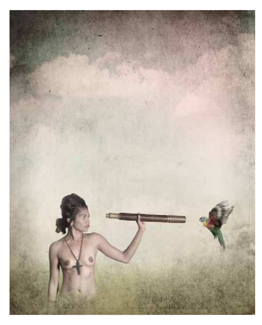
BROKEN DREAMS #7 (2010) Inkjet print (Epson UltraChrome K3™ inks on Hahnemühle Photo Rag® Bright White 310 gsm paper) 124 x 100 cm Edition 8