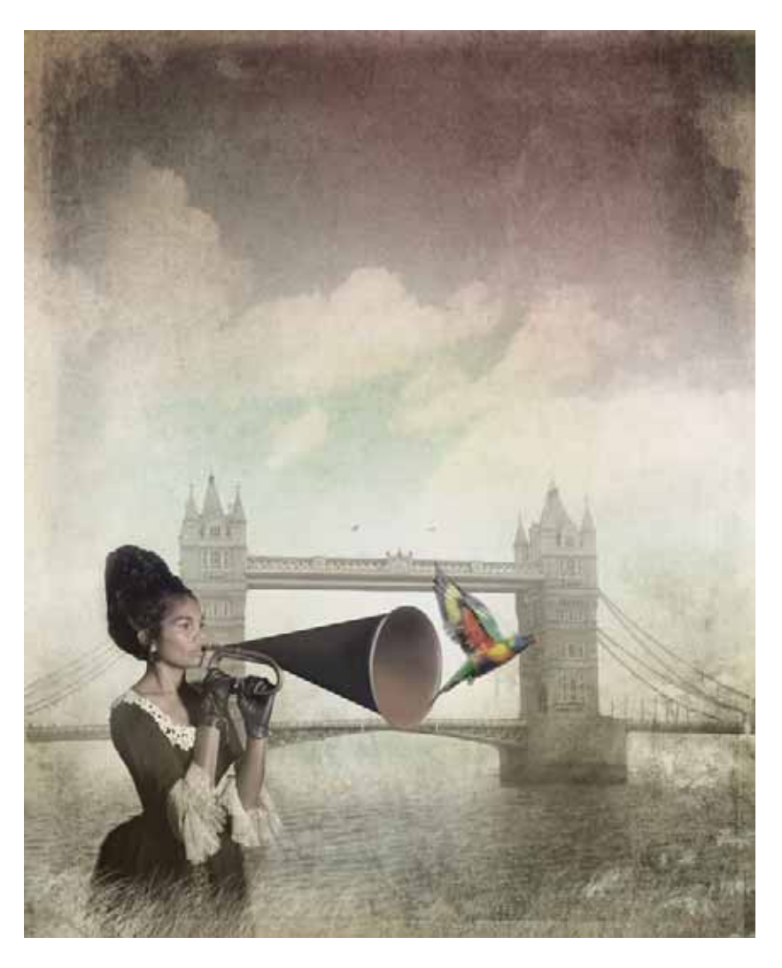
BROKEN DREAMS #2 (2010) Inkjet print (Epson UltraChrome K3™ inks on Hahnemühle Photo Rag® Bright White 310 gsm paper) 124 x 100 cm Edition 8